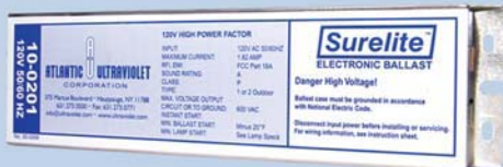
10-0201 120V, 50/60HZ

Contact our Ultraviolet Application Specialists for assistance on selecting a ballast.