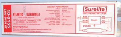
10-0155 230V, 50/60HZ